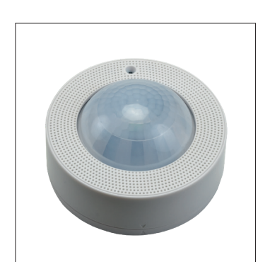
MCS IP65 wireless daylight&occ sensor